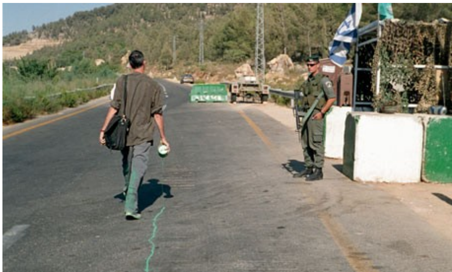
Image 8 Still image from The Green Line video documentation, 2005